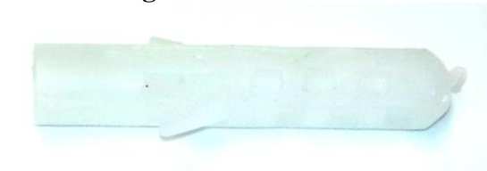
7. Wall plug M8X40 X 2