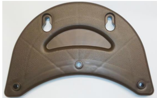
3. Backing plate