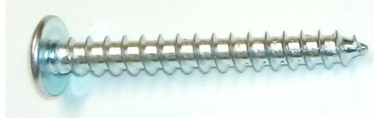
5. Mounting screw M6x60 X 2