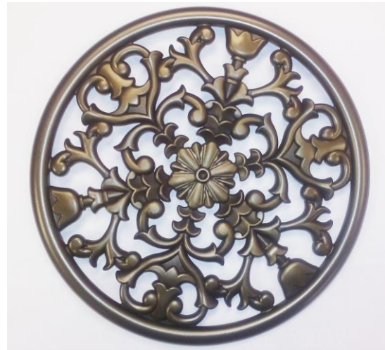
1. Filigree front