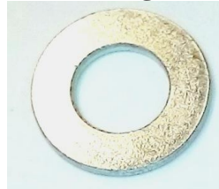
6. Mounting washer M6 X 2