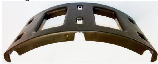
2. Hose rack